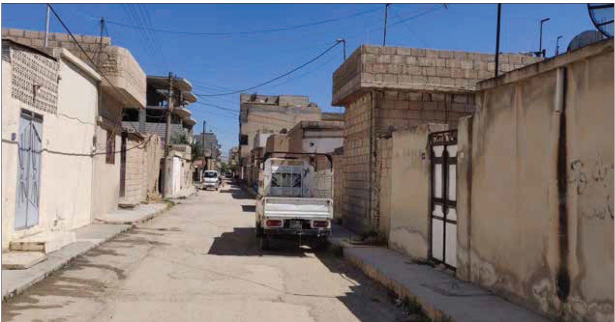
A typical neighbourhood in the small town of Amûda in Northeast Syria, where women go from house to house, explaining the importance of women's rights to their neighbours.

I t's nine thirty in the morning in the town of Amûda in Northeast Syria. Jamira claps her hands in front of a house in her neighbourhood. Its residents do not seem to be expecting a visit: no one opens the door. Viyan, an interpreter who accompanies me on this visit, stands at a distance from the typical one-