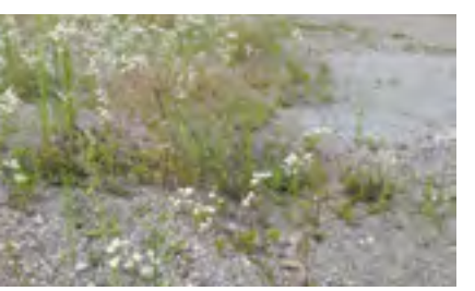
Annual ruderals | Einjährige Ruderalflur