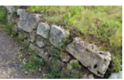
Perennial ruderals | Trockenwarme Mauerflur