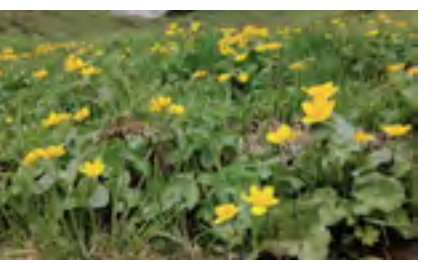
Moist grasslands | Nährstoffreiche Feuchtwiese