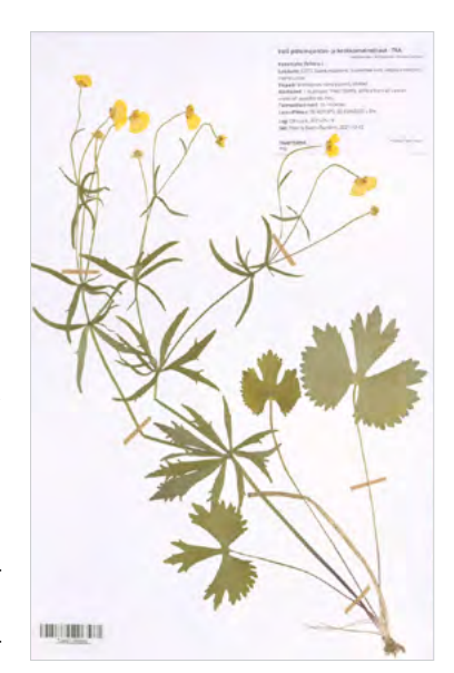
Fig. 1. Herbarium specimen of Ranunculus fallax (Herbarium of Estonian University of Life Sciences, TAA).