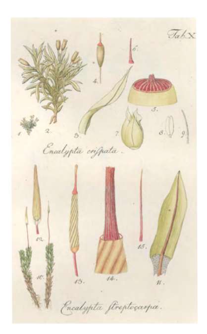
Fig. 1. An illustration from Hedwig's Species muscorum frondosorum of 1801 (Tab. X of Encalypta crispata Hedw. and E. streptocarpa Hedw.). He taught himself to draw to facilitate his work and his hand coloured plates are a testament to his observations and understanding of moss morphology.