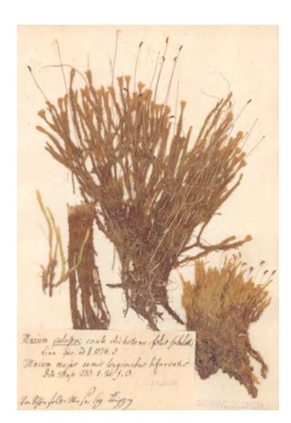
Fig. 2. Hedwig's herbarium contains a set of standardised herbarium sheets ( 16 \times 21 cm) that hold pressed specimens and a handwritten label. Here is the original specimen of Hedwig's Mnium palustre Hedw. ( Aulacomnium palustre [Hedw.]Schwägr.).