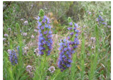
Fig. 1. Echium webbii Coincy. Species of the genus Echium in the Canary Islands are an example for adaptive radiation.