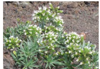
Fig. 2. Echium bethencourtii A. Santos