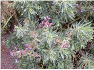
Fig. 3. Echium thyrsoiflorum Masson ex Link, also known under its synonym Echium gentianooides Webb ex Coincy.

climatic conditions. Surprisingly, we found a considerable proportion of taxa that have been recorded in scientific papers but are missing from current floras and data bases. Furthermore, we identified taxa with deviating status (e.g., surely native, probably non-native) between taxonomic databases. And still, new species are being detected and described. Data coverage of the Canary Island flora in different databases is far from being complete.