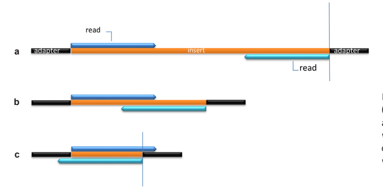
Fig. 1. Herbarium DNA fragments (orange) may be longer a or shorter ( b and c ) than Illumina read lengths, in which case reads are overlapping and could be merged. From Bakker (2018), with permission from Springer.

Herbarium DNA fragmentation can occur sometimes to the extent that the efficiency of paired-end sequencing using Illumina HiSeq (and hence subsequent sequence assembly) is affected. When template insert sizes are shorter than twice the Illumina read lengths applied, the actual sequencing reads will, meet in the middle' of the insert and start to overlap (Fig. 1). However, when template insert sizes are smaller than the Illumina read length applied, this will result in the presence of adapter sequence at the end of the read (Turner 2014). In both scenarios of read-overlap, the two reads can be merged into a single, longer read. In a previous study we used a series of 93 herbarium DNA samples (some of which 146 years old), representing 10 angiosperm families (Bakker et al. 2016). Overlapping read pairs were found to occur in roughly 80 % of all read pairs obtained. After merging such overlapping pairs the resulting fragments and their distribution can be considered to reflect (the ongoing process of) genome fragmentation up to the moment of DNA extraction. Merging reads enables assessing the distribution of genomic fragment lengths