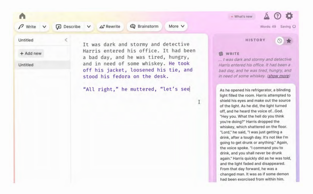
The Sudowrite interface; on the right, a suggested continuation of the story.

Conversely, one might ask: What kind of literature is most likely escape this expansion? Here I see two, at first glance, contradictory answers. If the unmarked, postartificial literature is one that absolutely mixes natural and artificial poetry, further marked writing would be one that emphasizes their separation .