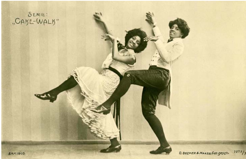
Figure 3: This postcard (ca. 1903) is part of a series depicting various stages of dancing the cakewalk. 24

Apart from the increased flexibility of the moving body, body postures changed in general. The cakewalk embodied a bent body to such an extent that it became the signifier of the dance: standing next to each other, the dancers did not touch each other, the upper bodies leaned backwards, and the arms as well as one leg typically were raised in the air (figure 3).