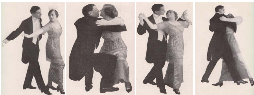
Figure 2a-d: Photographs of the famous dancers Oscar and Suzette. 23

All social strata enjoyed American popular dances. Like folk dances, they could easily be imitated because they shared characteristics that simplified dancing: They did not consist of formations and dance figures, and the main principle of moving forward was walking. For example, the main principle of the cakewalk was to walk around as a couple through the dance hall and then add a range of movements. Dancing bodies moved in various directions (and not just forward), but also on the spot, leaning to the side or even performing knee bends (figure 2b). 21 Furthermore, the performance and variety of dancing steps changed dramatically. For example, dancing one-step or two-step meant leaving the foot on the floor and even sliding, while the fish walk required small hopping steps or the legs to be raised high. 22 These various expressions of physicality were not characterized as figures but as a variety of movements that could be combined in endless ways.