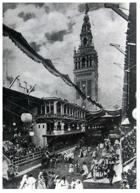
Fig. 2 Hippolyte Dernaz, L'Andalousie au temps des Maures in the Exposition Universelle in Paris 1900.

spectrum, including manor houses and mansions, interior spaces in which the oriental voluptuousness adapts to new forms of comfort or leisure, restaurants or cafés, facilities of mass entertainment, bullfight arenas, kiosks, public lavatories, etc. In this process, universal exhibitions constitute a privileged place of encounter between historiography, orientalist aes-