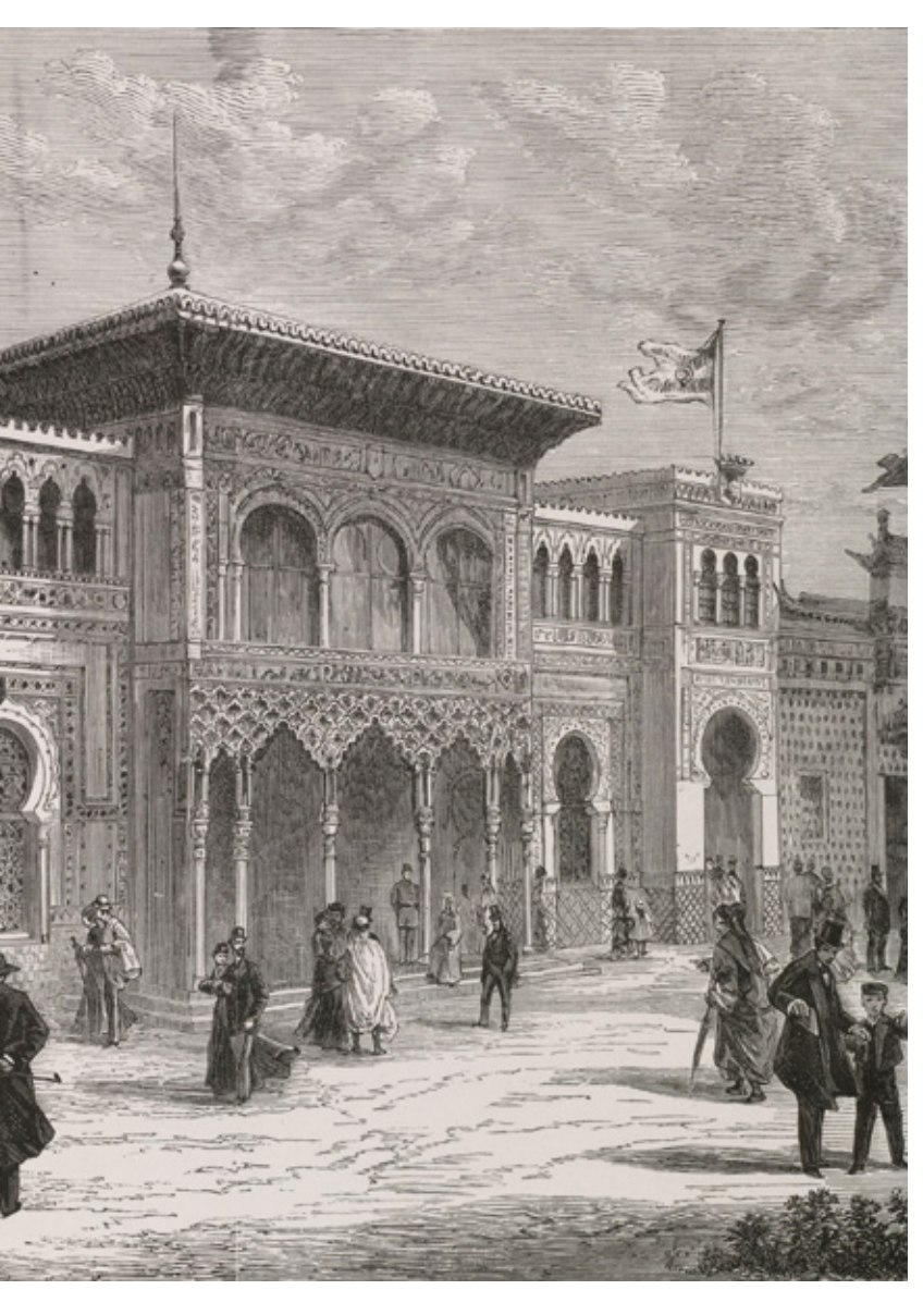
Fig. 1 Agustín Ortiz de Villajos, Spanish Pavilion in the Exposition Universelle in Paris 1878.