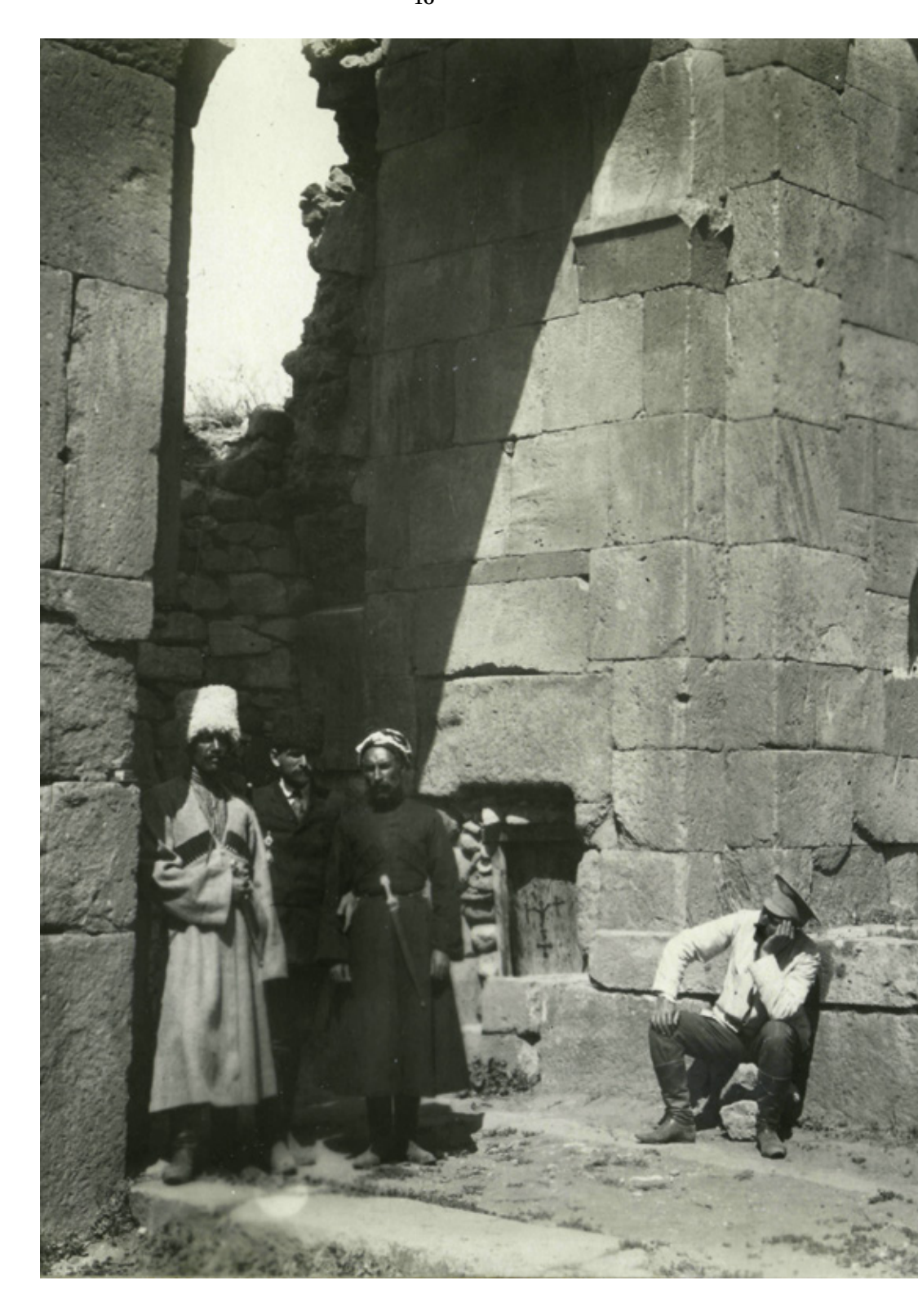
44 SGMOIK Bulletin